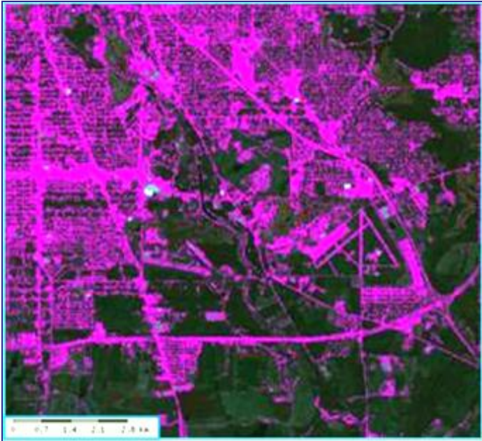
San Antonio, USA